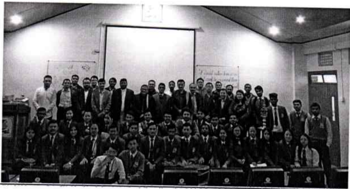
CAAAP-2019 COSING CEROMENY PHOTOGRAPH