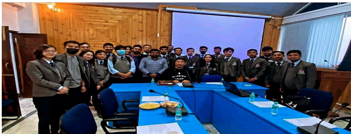
Parents Teachers Meeting was held in the Loyala Hall after covid period on 23/05/22 for 4th Sem & on 24/05/22 for 2nd Sem.