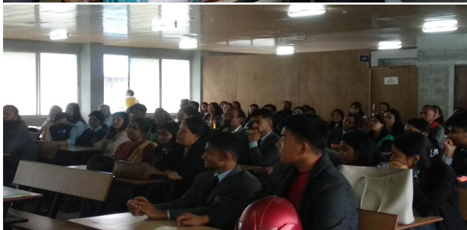
2nd batch of CPBFI was held in April 2022, in which 42 students of 6th semester participated, 32 of them successfully completed all the criteria.