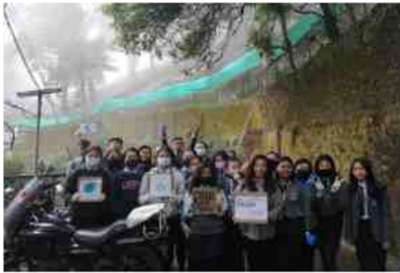
Participants from Dept. of Sociology in The Himalayan Cleanup 28 th May, 2022