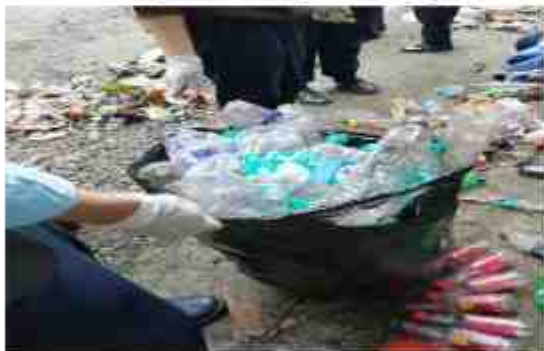
Collected Plastics during The Himalayan Cleanup 28 th May, 2022