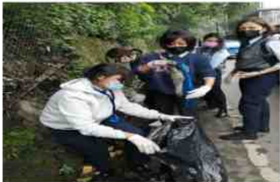
Students Collecting Plastics during the Himalayan Cleanup 28 th May, 2022