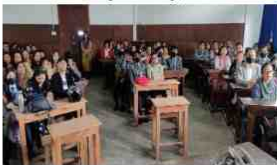
Parents-Teachers Meet of Dept. of Sociology, 6 th May, 2022