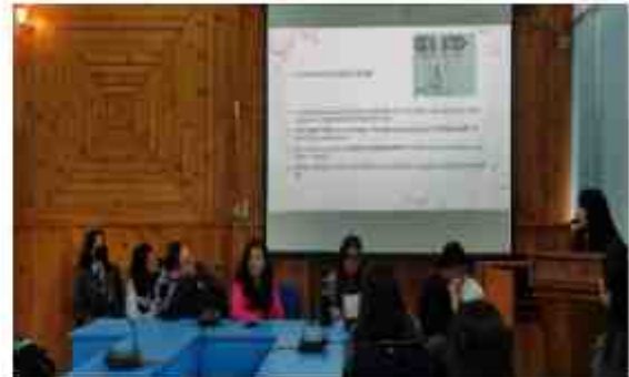
PPT during Student's Seminar, 10 th May, 2022