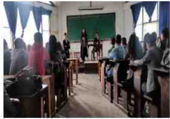
Parents-Teachers Meet of Dept. of Sociology, 6 th May, 2022