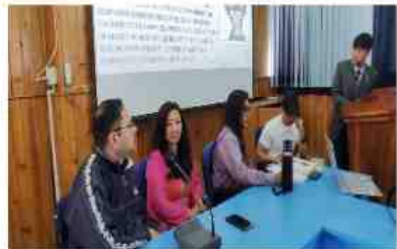
PPT during Students' Seminar, 10 th May, 2022