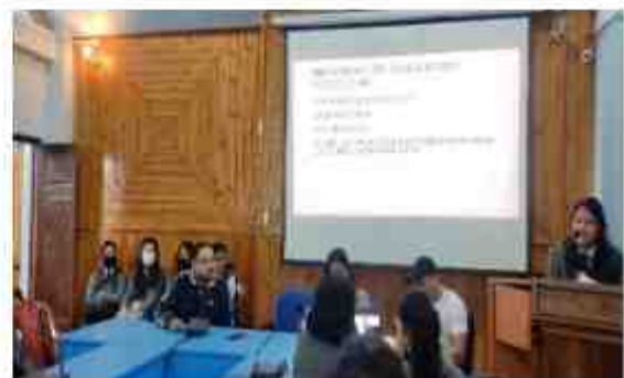
PPT during Students' Seminar, 12-13 th May, 2022