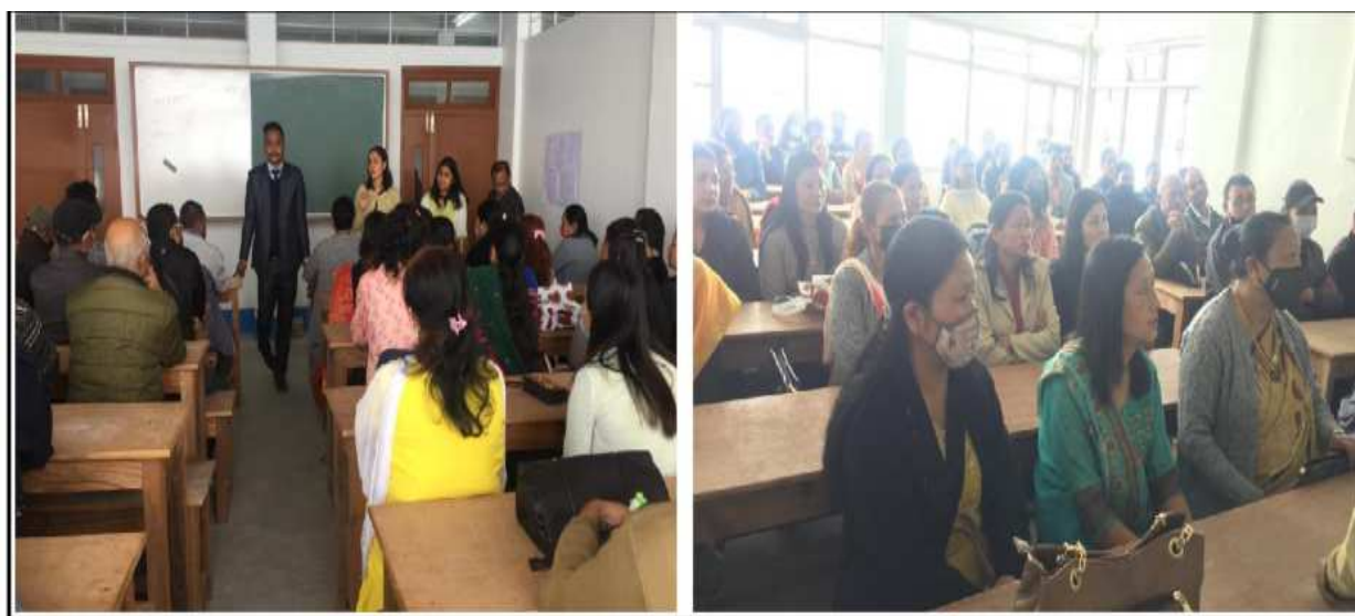
Fig: Some Glimpses of Parents and Teachers Meeting at the department of Chemistry