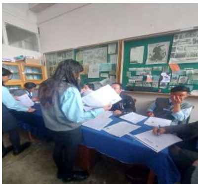
Department orientation 2022

The Department of History welcomed the newly admitted students on the 6 th of September 2022. The orientation programme for the fresh batch was held on the 8 th of September 2022. The total number of students admitted to the department was 73.