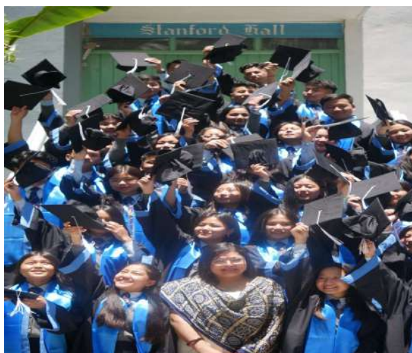
Graduating Batch 2023

The Academic Session ended with the commencement of the Semester exam conducted by the University of North Bengal.