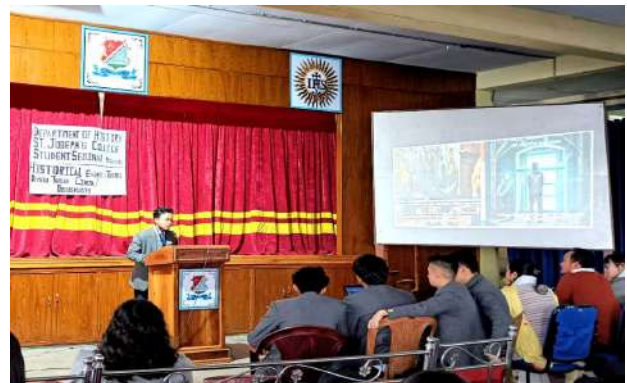
Departmental Seminar 09/09/2022