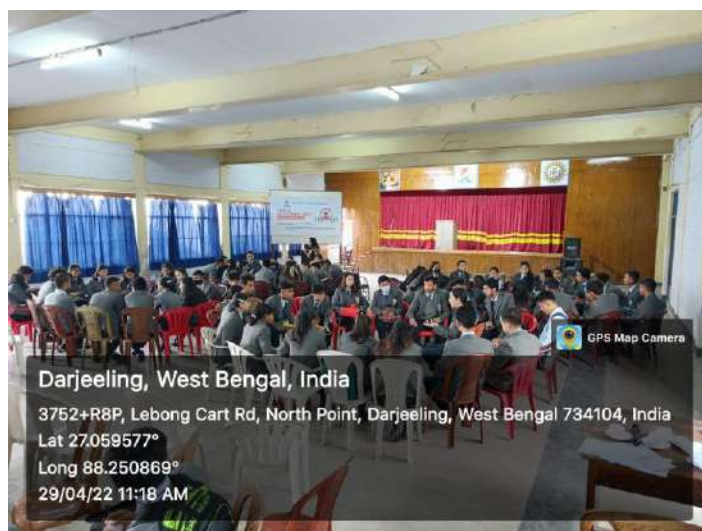
Stage I : Group Discussion