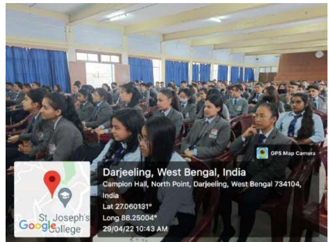
Students participating in Campus Recruitment Week lecture