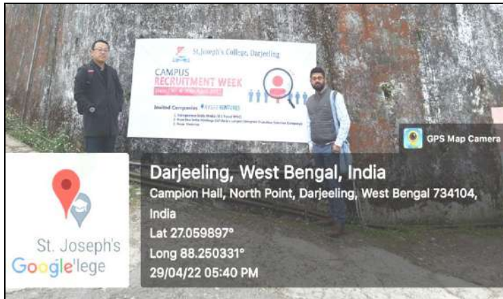
Campus Recruitment Banner