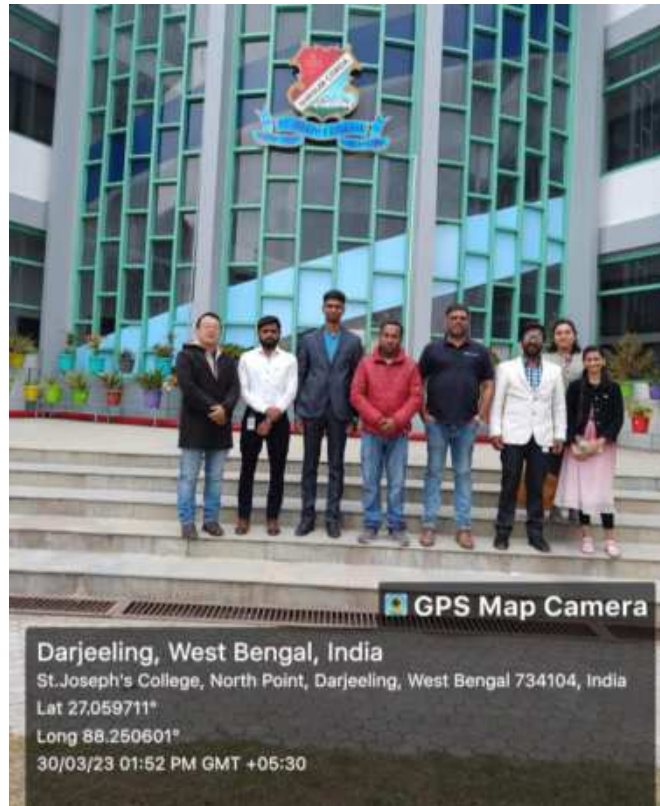
(SJC Placement & Career Guidance Cell Members and eduJournal Members)