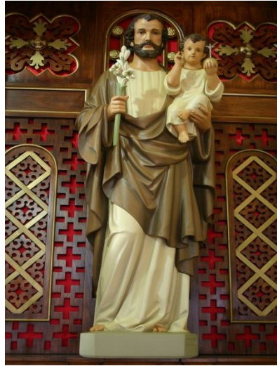
St Joseph (Patron Saint of St Joseph's College)

In the Gospel of St Mathew, Jesus returns to his hometown and taught the people in their synagogue. The people were amazed and said, Isn't he the carpenter's son? (13:55). Jesus is the son of God born of the Virgin Mary by the power of God's own spirit. Joseph was chosen by God to be the foster-father of Jesus and the spouse of the Virgin Mary. Joseph took loving care of Mary and gladly dedicated himself to Jesus Christ's upbringing. We also know that he came from the royal lineage of King David. Thus, St. Joseph appears as a strong and courageous man, a working man, yet in his heart we see great tenderness, which is not the virtue of the weak, but rather a sign of strength of spirit and a capacity for concern, for compassion, for genuine openness to others for love. Like him, we must lift our heart to protect all of God's people and embrace with tender affection the whole of humanity, especially the poorest, the weakest, and the least important.